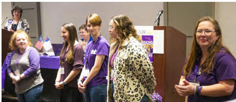
Young Woman Reps.