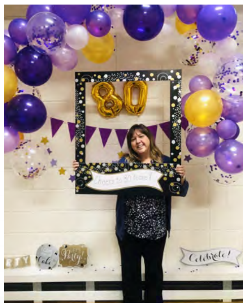
Galilee Lutheran, Pasadena, MD