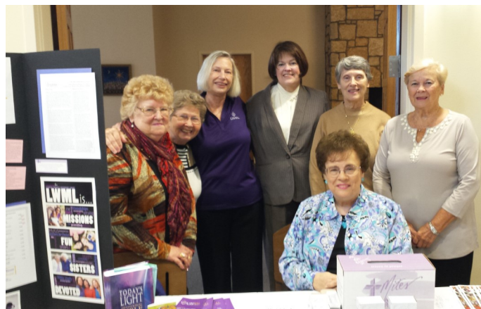
LWML of St. Andrews in Silver Spring, MD