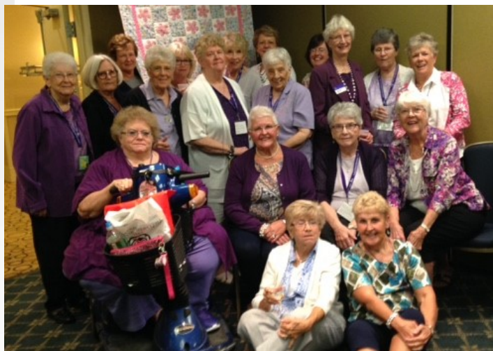
DELMARVA Zone at Ocean City