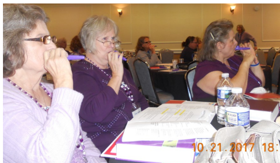
Kazoo playing at Ocean City Retreat