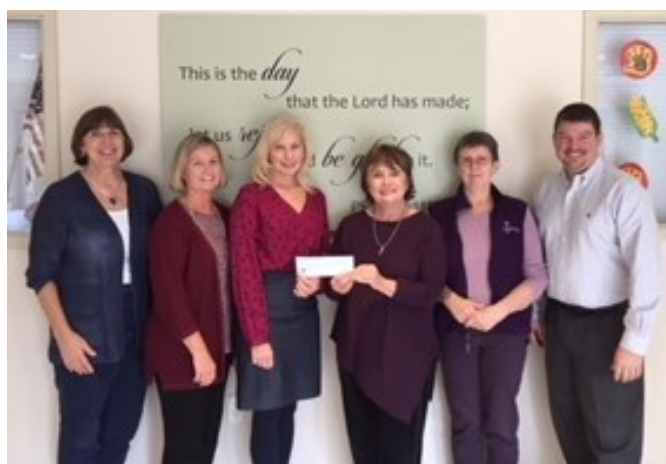
Grant check presentation to Redeemer Lutheran, Richmond