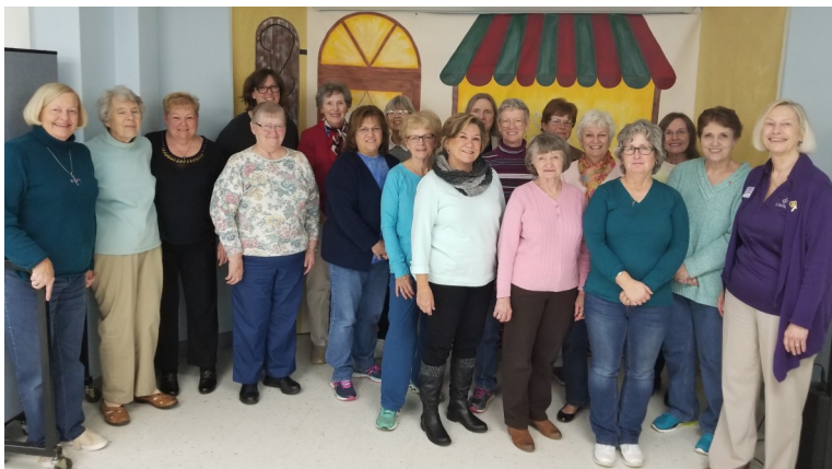
Women of Redeemer Lutheran, Fredericksburg, VA