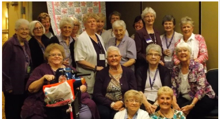
Del Marva Zone