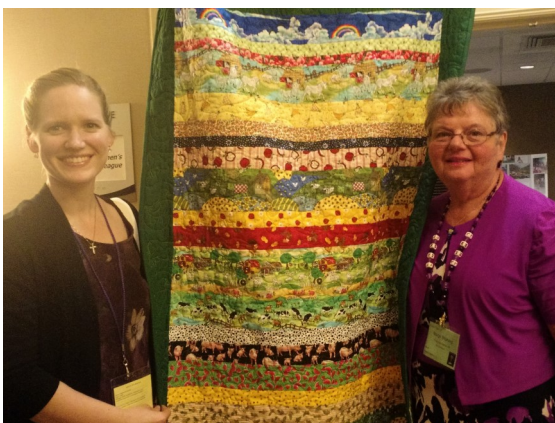
Old Dominion Zone