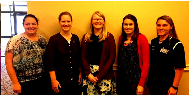
Young Woman's Representatives