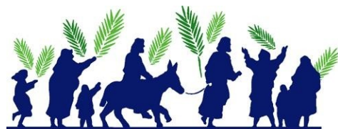
Procession of the Palms

But may all who seek you rejoice and be glad in YOU. Psalm 40:16