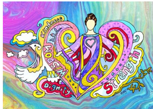
"...call her blessed" Proverbs 31:28