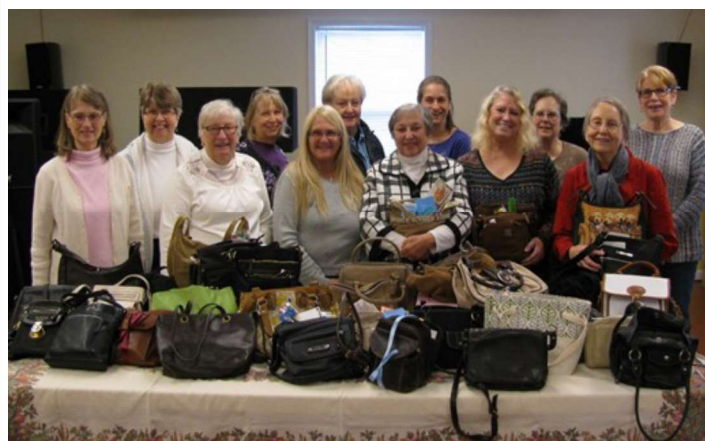
Ladies of Peace, Walkersville, MD

"We all have that one thing hanging over our lives that's been there a while. It keeps showing up. It sits smack dab in the middle of the room like the proverbial pink elephant. Everyone tiptoes around it but never discusses it. It could be an addiction to conquer, a habit to break, goal to accomplish, long-standing project to complete, relationship to restore (or toxic one to end), or even a debt to retire. What is your one thing? When it comes to persevering, observing the steps of Nehemiah provides lessons that you and I can learn and even deploy in our own lives to accomplish the extraordinary for the glory of God. The enemy will oppose us at every turn, but Nehemiah demonstrates how you and I can surround ourselves with people who are committed to God and our success. Nehemiah began with prayer and ended with praise as God provided the confidence, resources, and people that carried Nehemiah to successful completion." Mark your calendar to attend the retreat in November 2019. Want to learn more? More information will come in a future "Chesapeake Breeze."