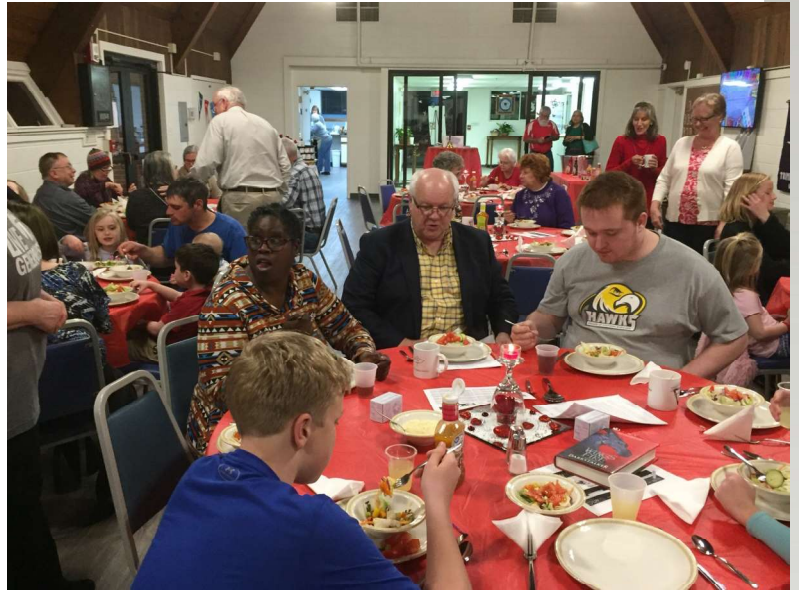
Trinity Lutheran Church LWML in Lexington Park, MD held a Spaghetti Dinner and raised $514 to help fund National Mission Grants.