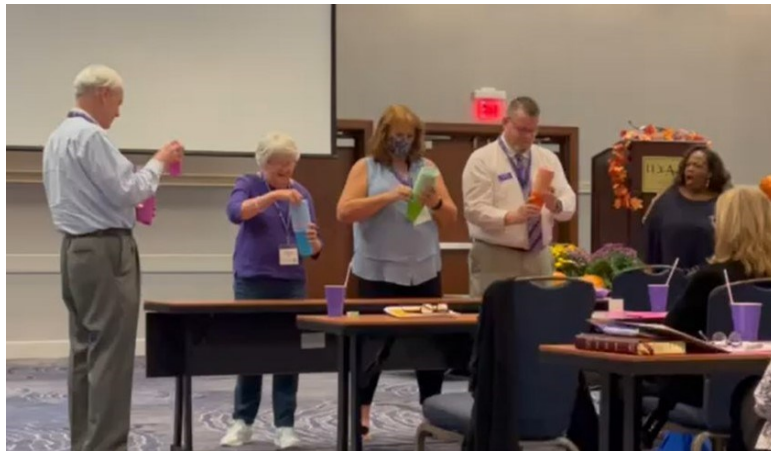
Saturday Night Fun